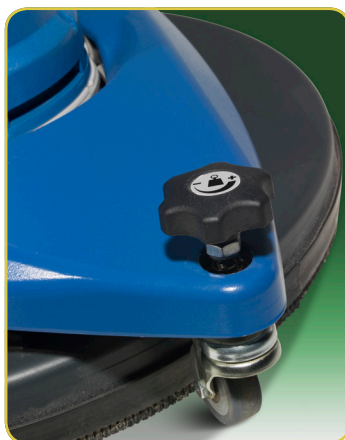
Simple load adjustment