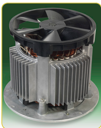
Hi-Cool heavy duty motor technology