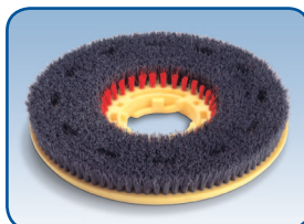
55cm Long life light duty scrubbing brush