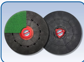
50cm PadLoc pad drive system

A full range of brush and pad drive systems are available for both models in order to provide the correct specification for the type of floor to be maintained. All brushes are fully interchangeable and can be varied to suit changing conditions or a change in location.