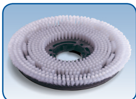
55cm Light duty scrubbing brush