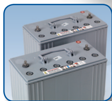
2x Fully sealed gel batteries