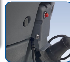
Plug-in charger system