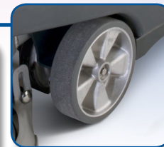
Traction wheels TTB6055T only

The 55cm (20") size of TwinTec is becoming more and more popular and, in support of this, we have introduced two new models with 60 litre capacity, a 50% increase over the 40 litre models and available in both traction and non-traction specifications.