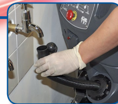
Flexifill 1m filling hose