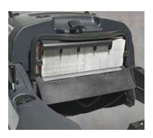
Thanks to the polyester filter the SW 750 can be used in both dry and humid areas.

CAN BE USED IN BOTH WET AND DRY APPLICATIONS DUE TO POLYESTER FILTER