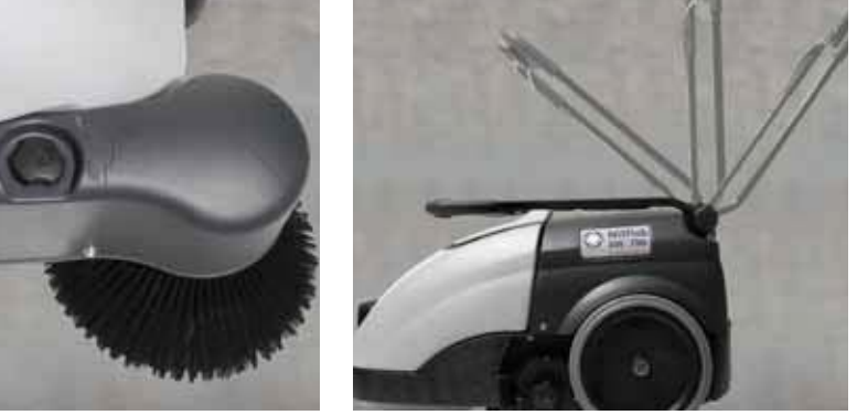
The main and side brushes are adjustable to ensure perfect pressure on the floor at all times and in all conditions.