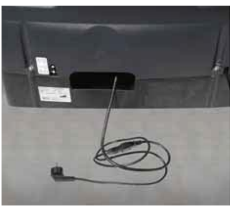
The plug-in onboard battery charger ensures continuous and hassle-free operation.