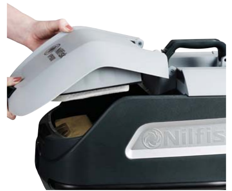
Magnetic hinges securing high reliability