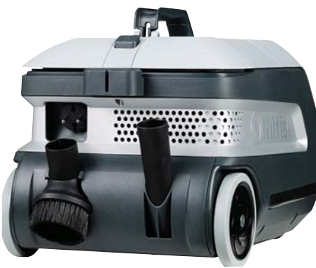
User friendly and easy to reach accessories