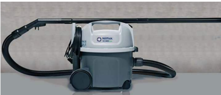
VC300 can be carried safely and comfortably in one hand