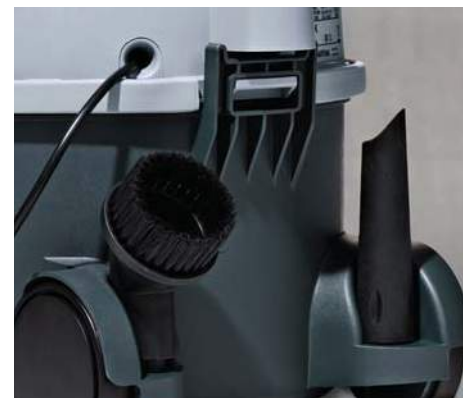
Discreet storage for nozzles allow all the tools you need to be within easy reach at all times