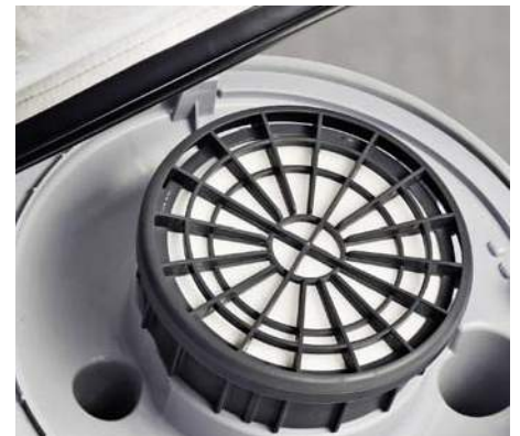
Higher filtration level with HEPA filter (VC300 HEPA)