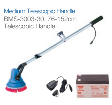
12V Battery and Battery Charger 12V 7A and BMS-BSE-1210

Your standard model MotorScrubber (BMS-2000M) starter kit includes: Motorhead complete with hub, backpack harness, 12 volt battery, battery charger, telescopic handle, medium duty brush, pad holder, green scrubbing pad, red cleaning pad, white buffing pad and microfibre pad.